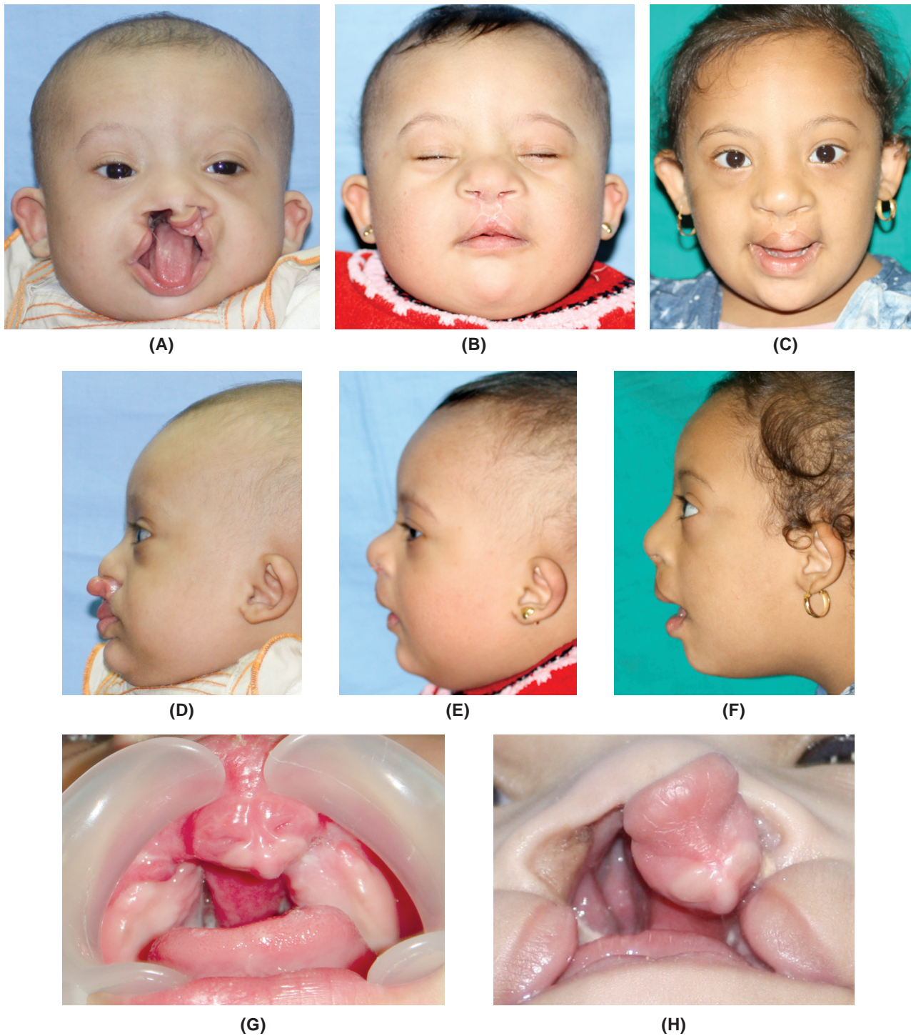
Fig. (3): (A) Front view of a six-month-old female with asymmetric form of bilateral complete cleft lip & palate. (B) Three months post and (C) Three & half years post were the open tip plasty is found to be advantageous over other techniques in restoring nasal symmetry. (D) Same patient's profile view at six months of age. (E) Three months post with adequate tip projection & columellar production (F) That was maintained over three & a half years post. (G) Oral view demonstrating the two lateral segments & the protruding premaxilla and (H) The sealed alveolus & anterior palate at three months post.